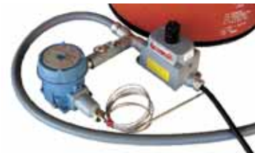
NEMA 7 Controller and High Temperature Limit Indicator Light