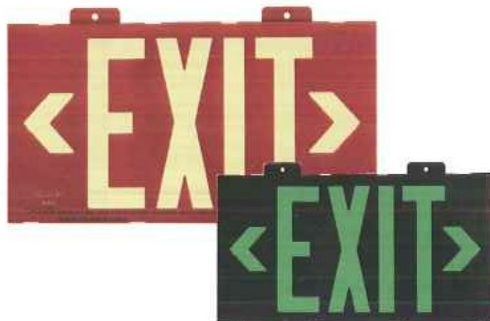
Actual Eco Exit sign in dark.