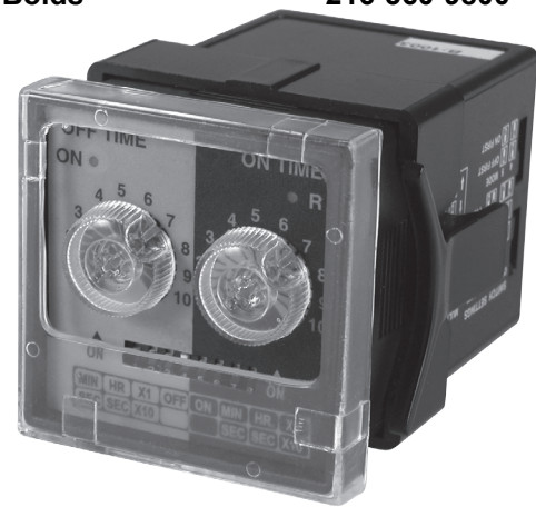
1/16 DIN Flip-Flop Timer